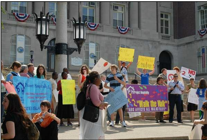
Project Hospitality consumers and community supporters, joined by members of the Faith In Action group from Pella IA, rally across from the Staten Island Ferry Terminal in support of continued funding levels for HIV/AIDS services.