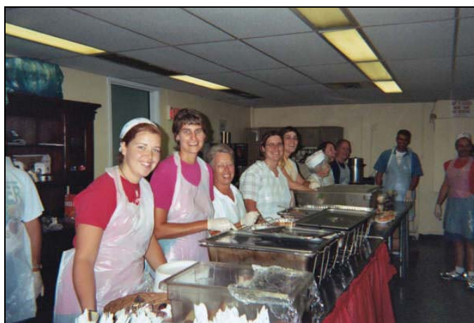
Faith In Action volunteers from North Park Reformed Church getting ready to serve lunch at soup kitchen.

American Reformed Church (Orange City IA) Blessed Sacrament R. C. Church (Erie PA) Church of the Nativity (Huntsville AL) Cranesville Reformed Church (Amsterdam NY) Firestone Park Presbyterian Church (Akron OH) Good News Presbyterian Parish (Columbiana OH) Grand Valley State University (Allendale MI) Michigan State University (East Lansing MI) New Era Reformed Church (New Era MI) North Park Reformed Church (Kalamazoo MI) Pitcher Hill Community Church (North Syracuse NY) Pultneyville Reformed Church (Williamson NY) Second Congregational Church (West Newton MA) Second Reformed Church (Pella IA) University of Scranton (Scranton PA) University of South Florida (Tampa FL)