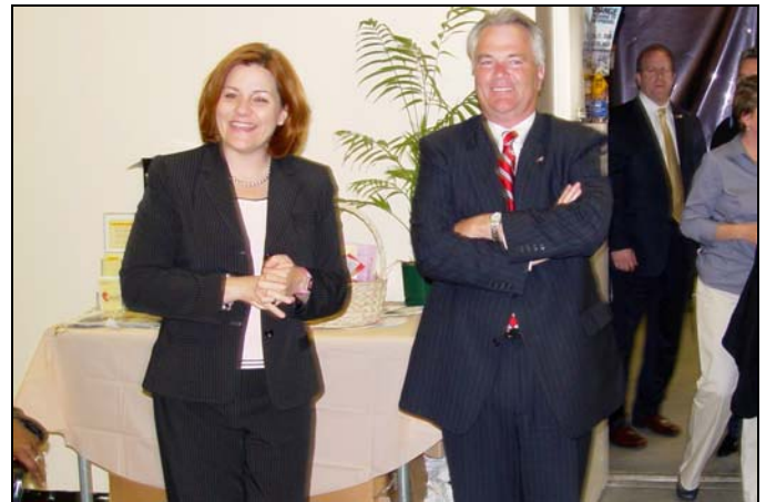
New York City Council Speaker Christine Quinn stands with Councilman Michael McMahon on visit to Project Hospitality's Community Services Center to tour food pantry, soup kitchen, and HIV/AIDS nutrition program.